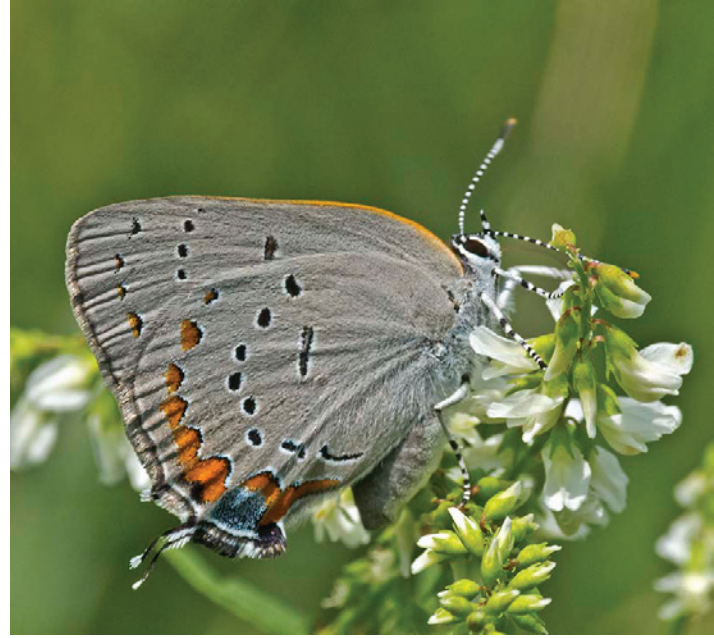
Acadian Hairstreak

2014 was a really good year for our other hairstreak species. Of the 81 MBA records of Acadian Hairstreak ( Satyrium acadica ), Striped Hairstreak ( Satyrium liparops ), Banded Hairstreak ( Satyrium calanus ), and Gray Hairstreak ( Strymon melinus ), 39 were recorded in 2014. The abundance was most notable in Acadian Hairstreak – 14 of the 20 records of that species are from 2014. The species is now recorded in 10 squares – prior to 2014 it had