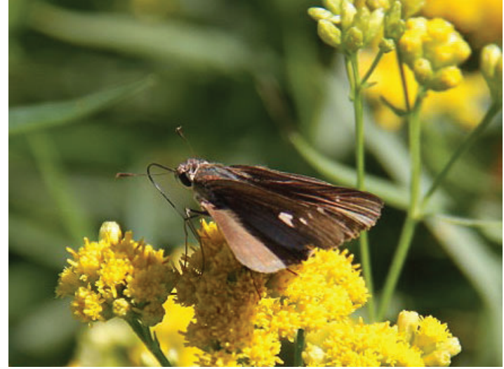
Ocola Skipper

Wagner of Maine. Ocola Skipper is a southern species with a permanent range that covers much of Latin America and the extreme southern United States. Some migrate north annually, and it regularly occurs as far north as Virginia. In Canada this species is extremely rare, having only been recorded in southern Ontario. The nearest records to the Maritimes are from Massachusetts, about 400 kilometers from Campobello Island! The Campobello record is the furthest north the species has ever been recorded.