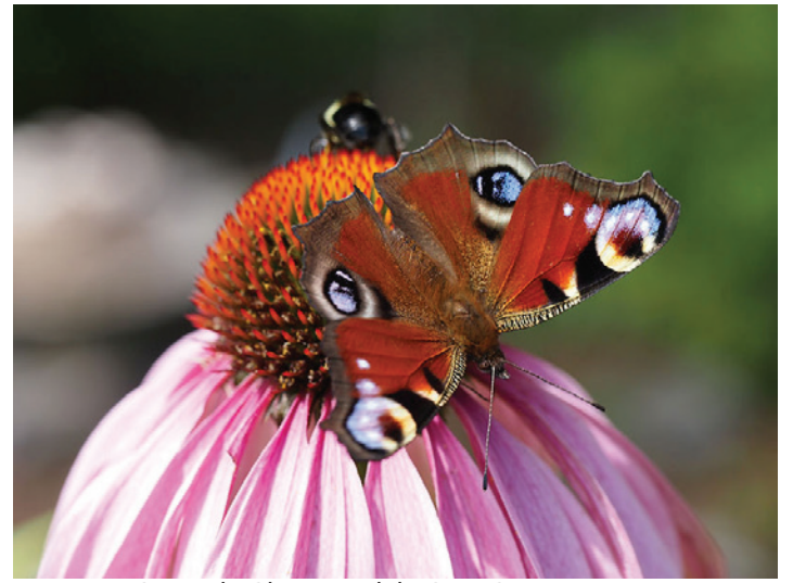
European Peacock