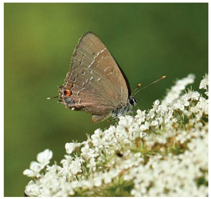
Banded Hairstreak

of the Halifax European Peacock is impossible to know with certainty, but it seems unlikely to be a natural occurrence. The individual in the Evers' garden was extremely fresh, suggesting that it did not fly there from Montreal. It was most likely brought into the Halifax area as a pupa on a shipping container. There is a remote chance that a population could become established in the Halifax area; however, that too seems unlikely, as the species' host plant, Stinging Nettle ( Urtica dioica ), is not common in the region.