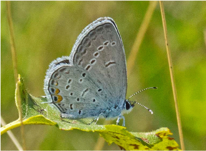
Eastern-tailed Blue - Photograph by Phil Schappert